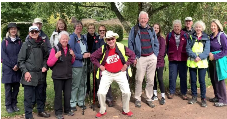
Some of the walkers taking a break at Amisfield Gardens

The Sponsored Walk took place on Saturday 14 th September. St Mary's Church Walking Group kindly invited CA supporters from Haddington Churches and beyond to join them on their monthly walk in September in support of the Harvest of Hope campaign . The 6 mile walk started at St Mary's Church North Door and finished at The Trinity Centre where refreshments were provided and packed lunches were eaten. 21 walkers participated this year and, although the weather was a bit dull and cool, it was perfect for walking. An amazing sum of £1015 was raised. Thanks to all who took part, donated or supported in any way.