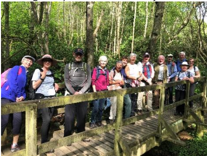
Walking Group near Gifford in May